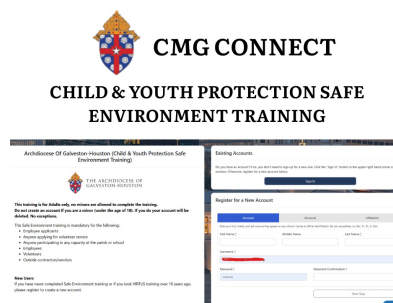
Catholic Mutual Group: Safe Haven Instructional Flyer