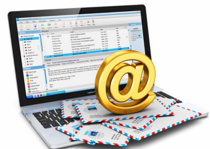
National Society of St. Vincent de Paul Member Database