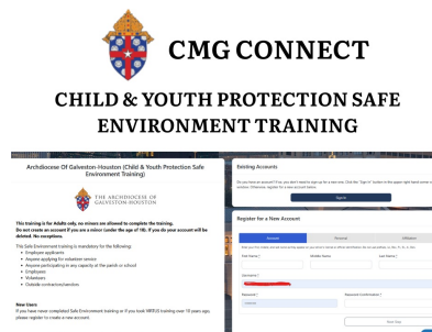
CMG Instructional Flyer