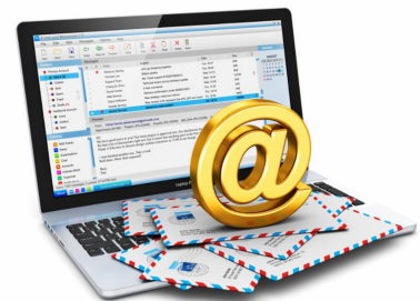
Vincentian Services Email