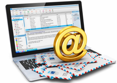
Vincentian Services Email