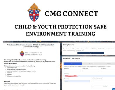
CMG Instructional Flyer